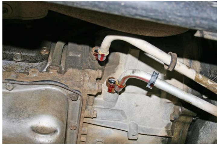
Disconnect transmission lines from transmission.