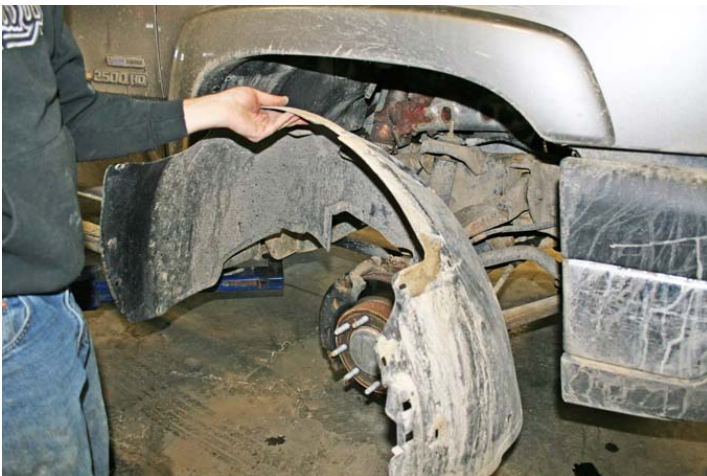
Remove right front tire and wheel liner