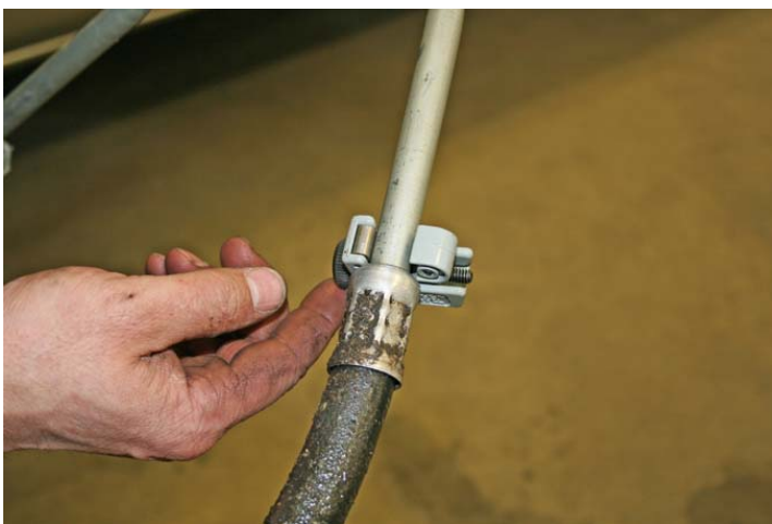
Cut all tubes as close as possible to the crimps with the compact tubing cutter (available on our Web site. ) NOTE: If using a hacksaw or cutoff wheel, be sure all grindings, shavings and burrs are removed and lines are clean. After all ends are removed, mark all cut lines at 1/4" from end with a marker.