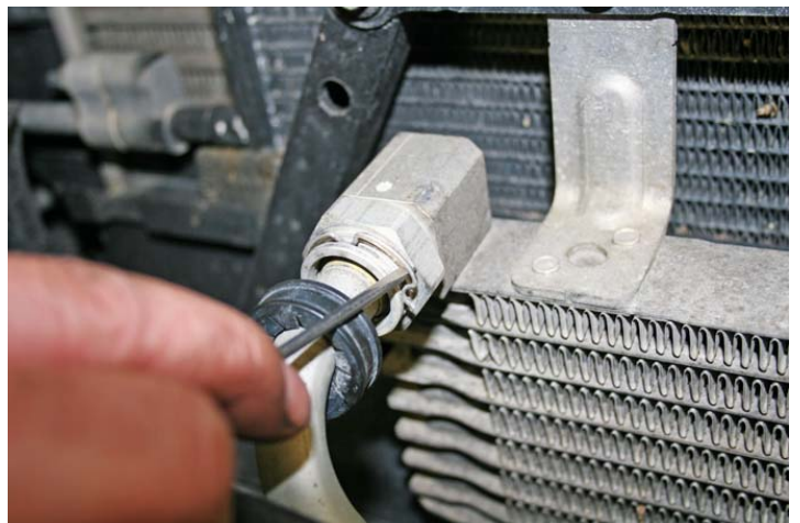
Remove all hydraulic lines by prying off plastic caps and removing spring clips with screwdriver or pick.