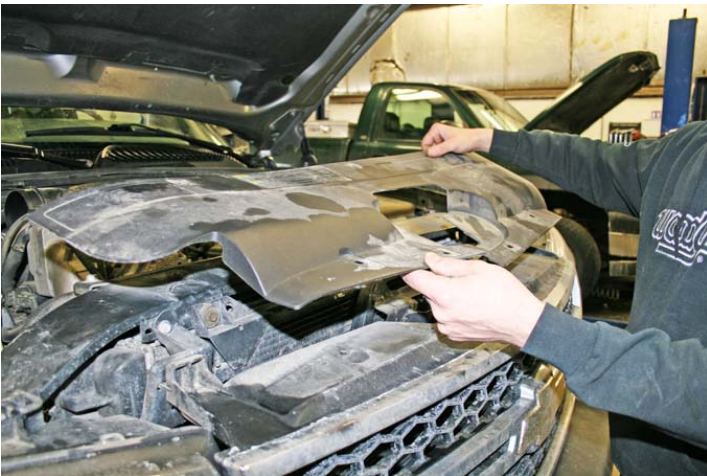
Remove radiator cover