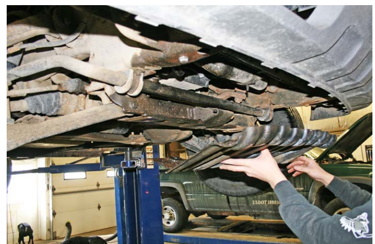
Remove skid plates

Make a note on the orientation of the transmission cooler lines (LB7 and LLY repair lines are all the same length). Bottom line of transmission goes to bottom fitting on radiator. Upper fitting of radiator goes to passenger side of external transmission cooler. Driver's side of transmission cooler goes to upper fitting on transmission. ('06-'10 models) Hose from the transmission to radiator requires the longer repair hose, hose from radiator to cooler takes the shortest hose and hose from cooler to transmission takes the intermediate hose.