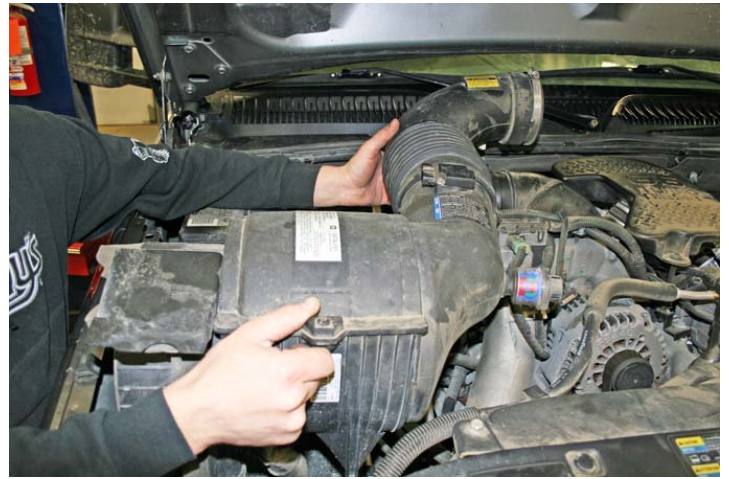
Remove air box assembly