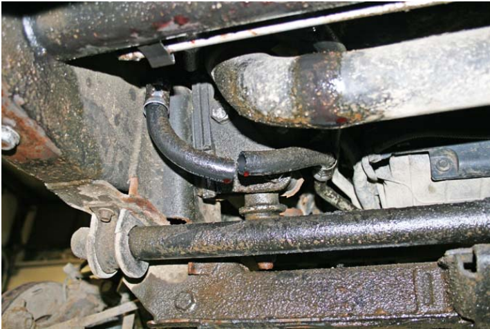
Cut the factory transmission cooler line (rubber portion) to drain the transmission fluid from lines