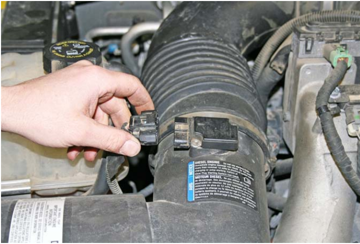
Disconnect mass air flow sensor (MAF)