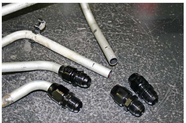
Install the compression fittings on the tubes and tighten. It's important to really torque these fittings. Don't strip the threads, but use good force. Install and fully torque the longest hose assembly on the tube going to the lower radiator. It will be difficult to install this hose on vehicle. Install all back in truck.