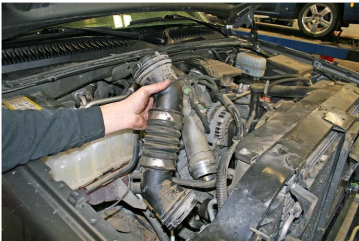
Remove intercooler pipe for ease of installation *CAUTION: BE VERY CAREFUL TO NOT GET DIRT AND DEBRIS IN INTERCOOLER