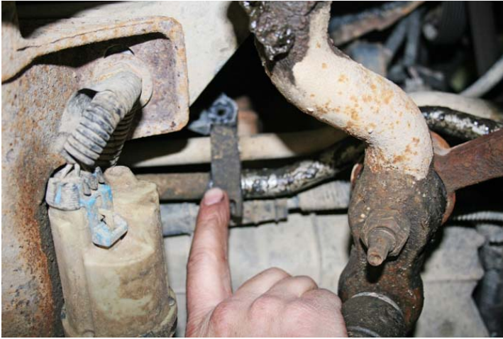
Unbolt transmission line bracket from motor