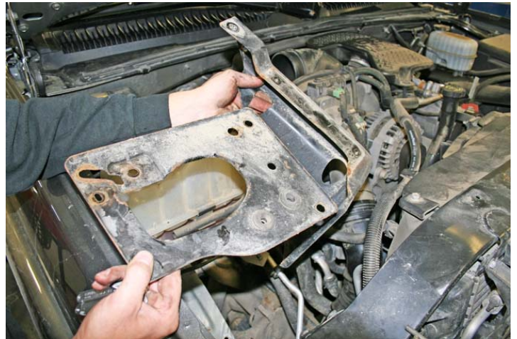
Remove air box tray and support