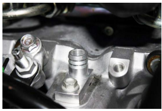
Step 3: Mount the billet fittings using the 6mm bolts removed in step 2 as shown. One for each valve cover.

This vehicle only had 600 miles and it's already full of oil. Imagine what your intake system would look like after 100,000 miles!