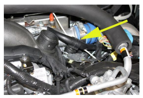
Step 2: Remove the PCV crossover tube by removing 6mm bolts on each valve cover and loosening hose clamp in center (see arrow). The 6mm bolts will be needed later.