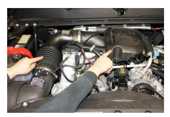
Step 1: Remove the intake tube and silencer as shown in photo above.