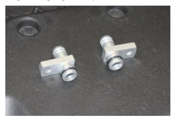
Here are the two billet fittings that will be used to mount the new hose. The O ring ends will be mounted into the valve covers. It's a good idea to put a little oil on the O rings to facilitate installation.

Here is the crossover tube removed from vehicle. Make sure you save this because if you ever need it again, it's going to cost you $400 at the dealer!