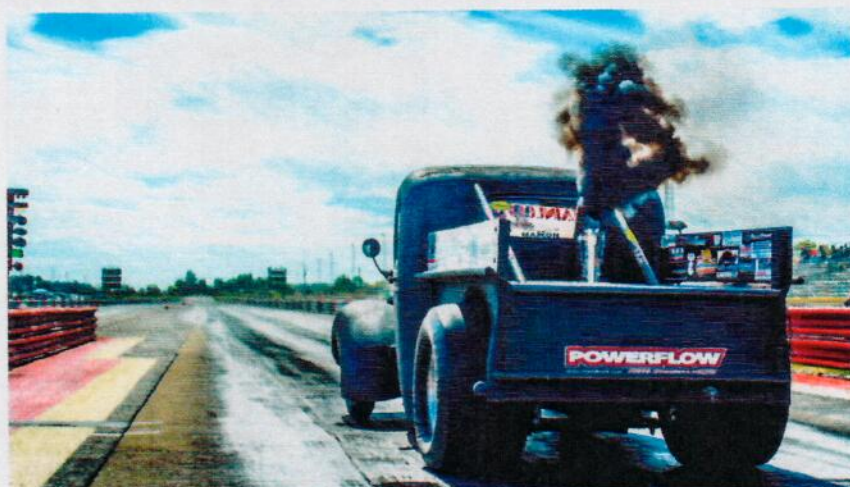
Doug Brarens placed first in the Quick Diesel 12.0 index. His top speed was 102.26 mph with a 12.24 ET.

On the racing front, Diesel Motorsports had three classes of drag racing along with a couple of exhibition runs in a Top Diesel (Duramax rail dragster). There were also six classes of diesels competing in