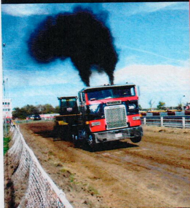
Semi trucks with a few modifications are real crowd pleasers.