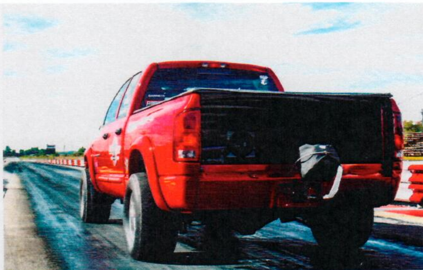
Bruce Block was the top dog in the Unlimited class for drag racing. He turned in a 10.17 ET at 135.04 mph.

"ON THE RACING FRONT, DIESEL MOTORSPORTS HAD THREE CLASSES OF DRAG RACING ALONG WITH A COUPLE OF EXHIBITION RUNS IN A TOP DIESEL (DURAMAX RAIL DRAGSTER)."