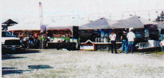
Vendors row is a good place to look for new products and ask questions of the manufacturers' reps. The crowds come and go, depending on how hot the track action is at the moment.

the pulling. These included Work Stock (street trucks), 2.5, 2.6, 3.0, Modified and Semi trucks.